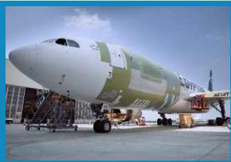
Freighter Conversion (P2F)

Certified Maintenance Organisation DE.145.0040