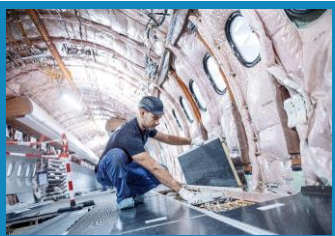
Cabin Solutions & Aerostructures

Certified Production Organisation DE.21G.0005