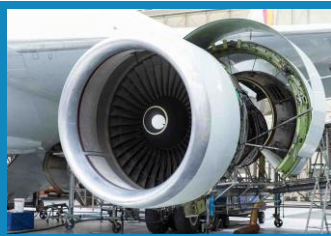
Maintenance Repair and Overhaul

Certified Maintenance Organisation DE.145.0040