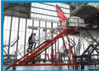
Continuing Airworthiness Management

Certified Maintenance Organisation DE.CAMO.0055